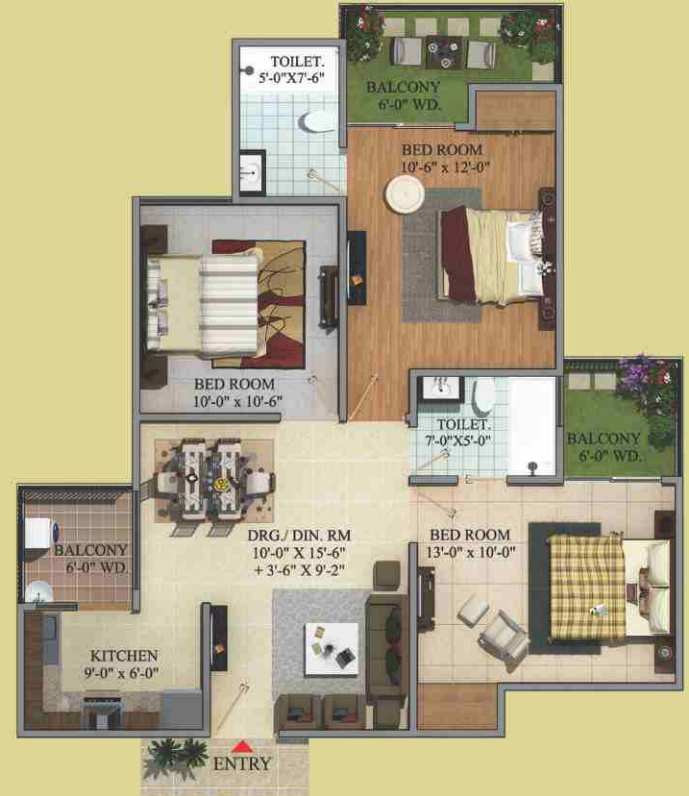
3 BHK + 2 Toilet Super Area = 1297 sq.ft.