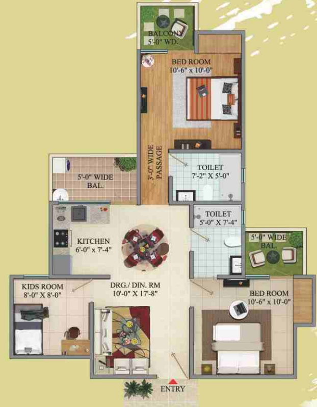
2 BHK + 2 Toilet + Kid's Room Super Area = 1095 sq.ft.