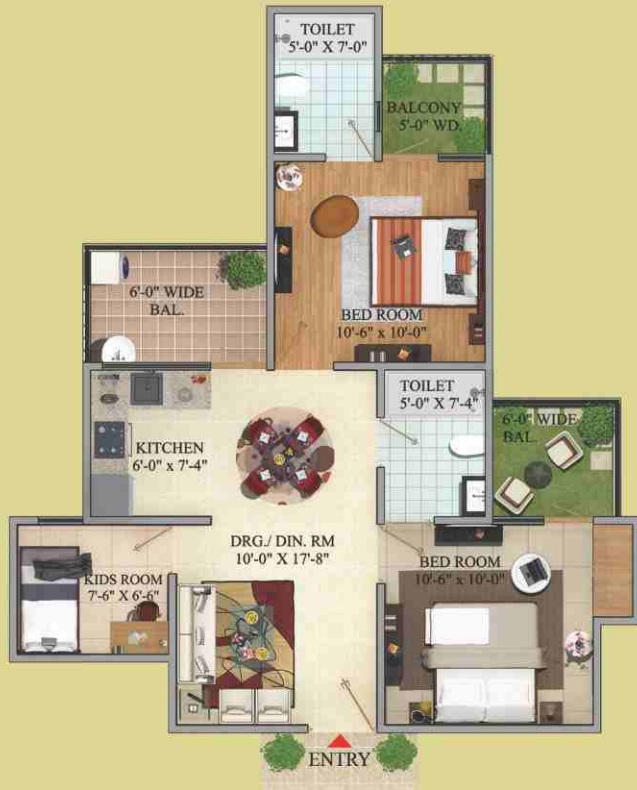
2 BHK + 2 Toilet + Kids Room Super Area = 1050 sq.ft.