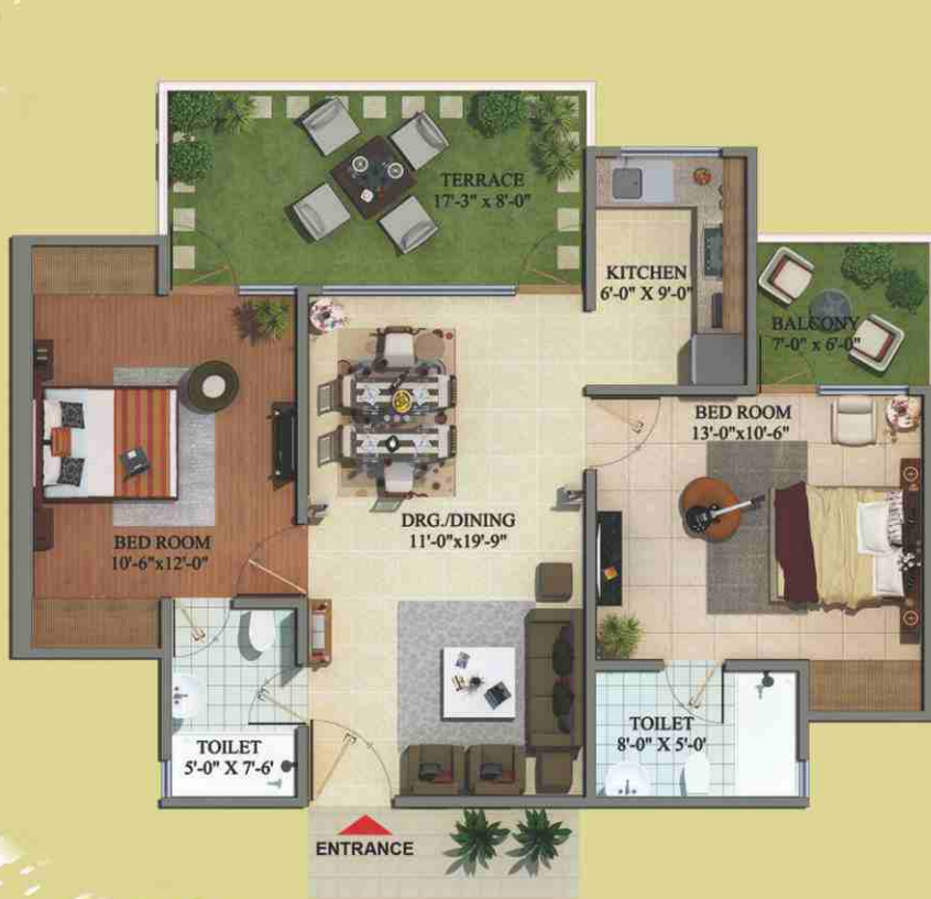
2 BHK + 2 Toilet + Terrace Super Area = 1275 sq.ft.